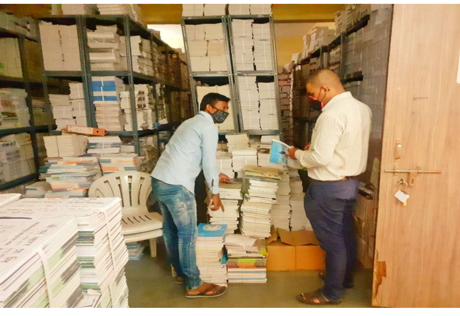
BOOK DISPATCH STORE