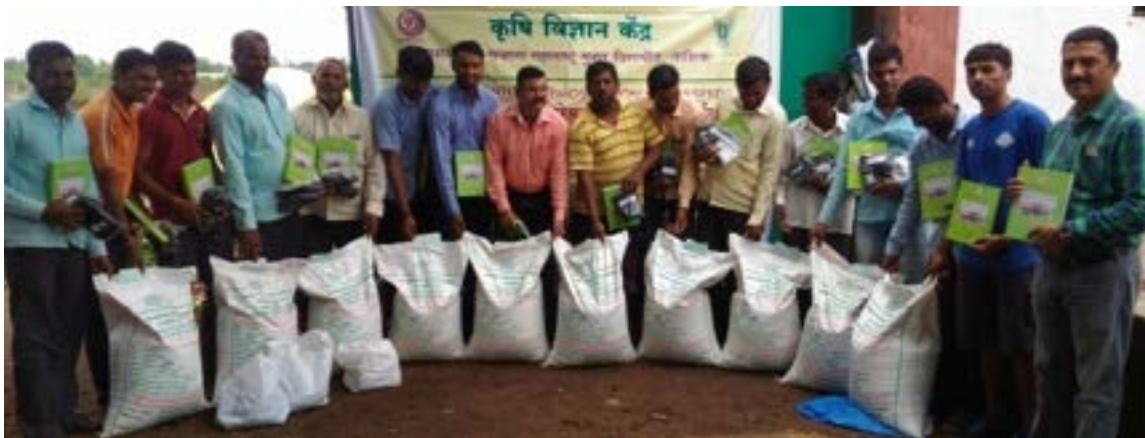
Critical inputs Seed and literature distribution of to soybean growers for CFLD in village Moh, Tal. Sinnar