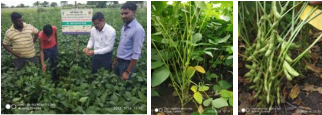
Left : Monitoring OFT Soybean plots of Phule Sangam by the scientists at Moh, Tal. Sinnar Right : Flowering and pod development stage of OFT Soybean at Moh, Tal. Sinnar