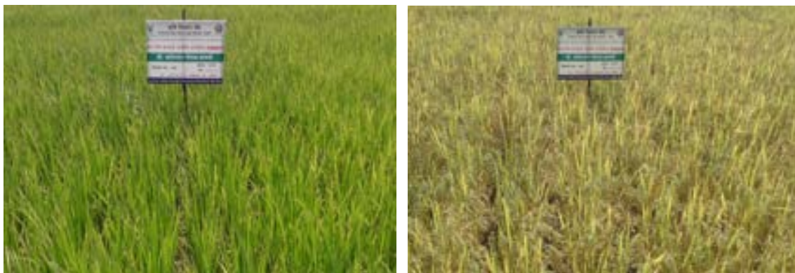
Left : Flowering stage FFT demonstrated paddy plot in village Jategaon, Tal. Trymbakeshwar Right : Milk stage FFT demonstrated paddy plot in village Jategaon, Tal. Trymbakeshwar