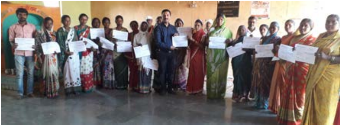
Soil Health Card of CFLD plots of chickpea distribution by scientists in village, Bahadurwadi T. Chandwad