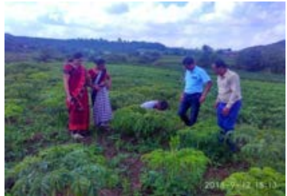
Left :OFT On Elephan Yam (Suran) Field Day at Village Chakore Tal- Traymbakeshawar Right :OFT On Elephan Yam (Suran) at Village Chakore Tal- Traymbakeshawar