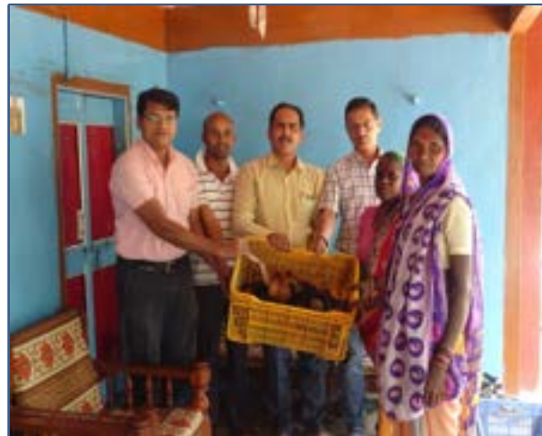
Left : Introduction of Improved desi breed of Poultry Giriraja in tribal village Right : Distribution of Giriraja birds in Front line demonstration program for tribals