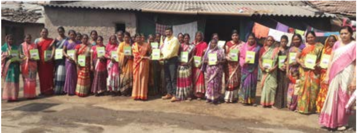
MPKV Krushi Darshani Agriculture informative literature for upscaling knowledge of Chickpea Growers under CFLD in village, Bahadurwadi Tal. Chandwad