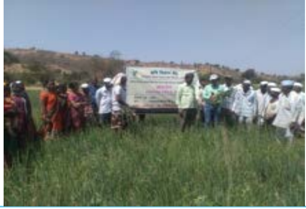
Left : FLD Onion Var. NHRDF Red-3 Seed distribution at Village Jategaon - Traymbakeshawar Right : FLD Onion Var. NHRDF Red-3 Field Day at Village Jategaon Tal - Traymbakeshawar