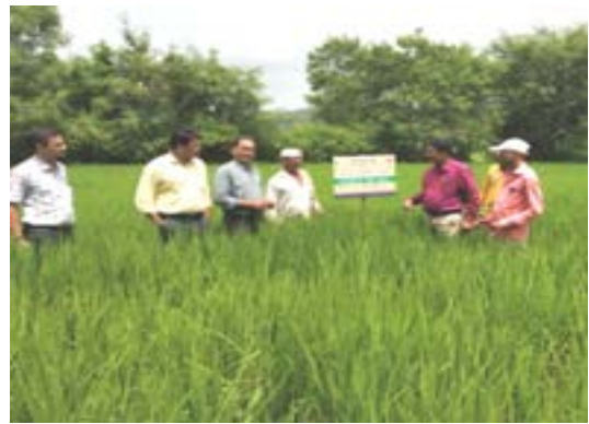
Left : STCR based fertilizer distribution at Jategaon (Bk), Traymbakeshwar Right : Monitoring STCR plot by Scientists at Jategaon (Bk), Traymbakeshwar