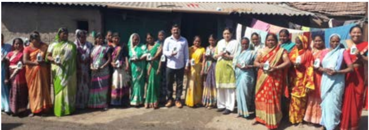
Neem based insecticides for controlling Helicoverpa sp. for chickpea CFLD plots by scientists in village, Bahadurwadi T. Chandwad