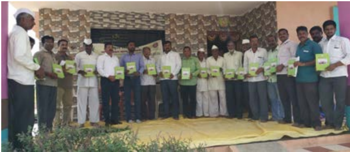
Distribution of literature Agriculture Diary to soybean growers in village Moh, Tal. Sinnar