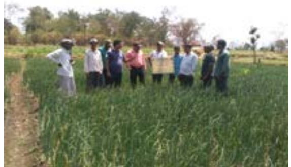
Left : STCR based fertilizer distribution at Jategaon (Bk), Traymbakeshwar Right : Monitoring STCR plot by Scientists at Jategaon (Bk), Traymbakeshwar