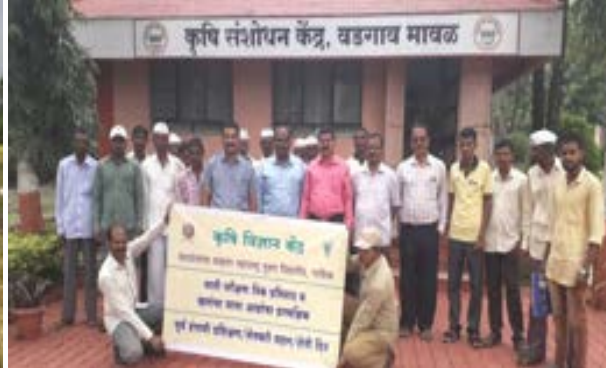
Left : Field day celebration on STCR Paddy at Jategaon (Bk), Traymbakeshwar Right : Exposure visit of PF at ARS, Wadgaon Maval, Pune