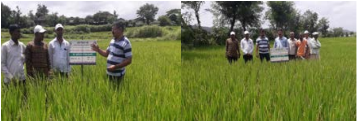
Left : Monitoring FLD plots of Paddy FFT by the scientists at Jategaon, Tal. Trymbakeshwar Right : Monitoring FLD plots of Paddy FFT by the scientists at Jategaon, Tal. Trymbakeshwar