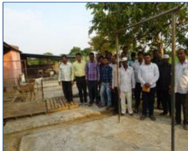
Left : Training of SHGs for poultry rearing at KVK experimental farm Right : Rural youths study tour at commercial goat farms