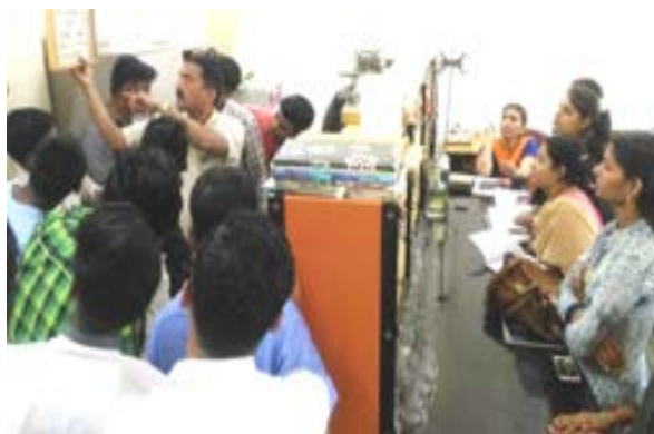
Left : Training on INM Onion at Jategaon (Bk), Traymbakeshwar Right : Training on Soil and Water testing for Rural Youth at KVK campus