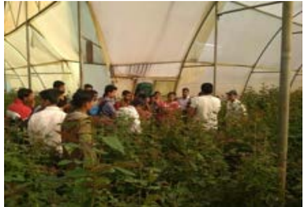
Left : Exposure visit High Density Mango Plantation Under TSP Village Chitapalli Right :Exposure visit of Rural Youths to protected cultivation of Roses at Village Mohadi