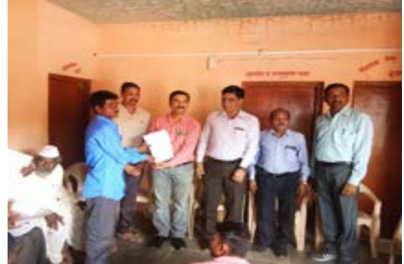
Left : Collection of soil samples at Jategaon (Bk), Traymbakeshwar Right : Soil Health Card distribution at Jategaon (Bk), Traymbakeshwar