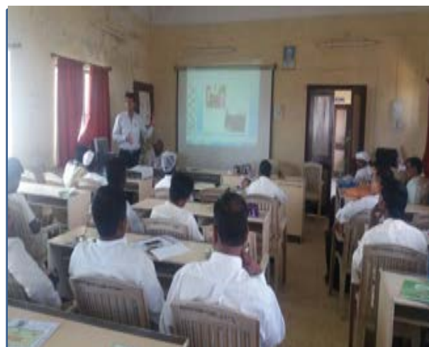
Left : On campus SHG training Program for increasing income potential through A.H. Right : Training for Extension functionaries