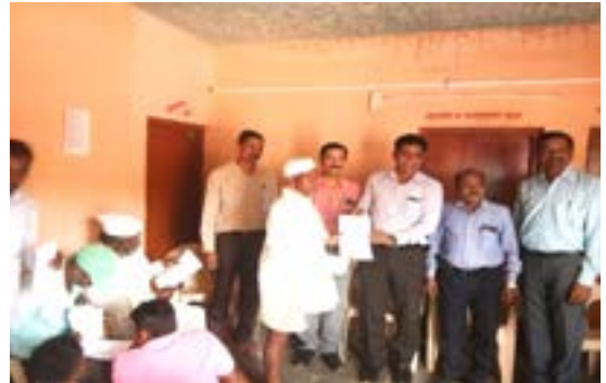
Left : Collection of soil samples at Jategaon (Bk), Traymbakeshwar Right : Soil Health Card distribution at Jategaon (Bk), Traymbakeshwar