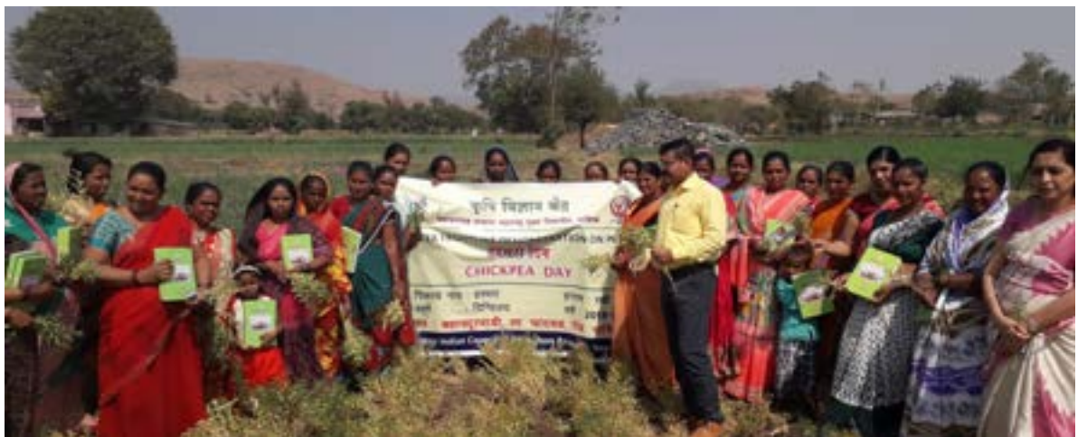
Celebration of field day of chickpea CFLD in village, Bahadurwadi Tal. Chandwad