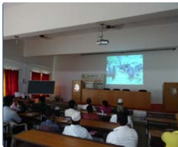
Left : Introduction of pure Osmanabadi goats in tribal village Right : Training of Tribal farmers for Goat rearing