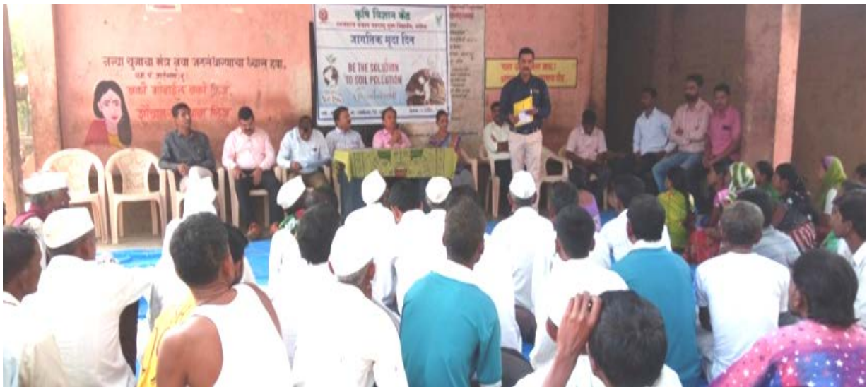
World Soil day : Awareness training on Soil Health Management at Jategaon (Bk), Traymbakeshwar