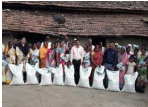
Left : Group discussion among the farmers in village, Bahadurwadi Tal. Chandwad Right : Critical inputs seed of Digvijay at Bahadurwadi Tal. Chandwad