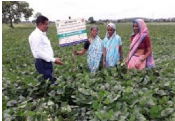
Left : Monitoring CFLD plots of Soybean by the scientists at Moh Tal. Sinnar Right : Monitoring CFLD plots of Soybean by the scientists at Moh Tal. Sinnar