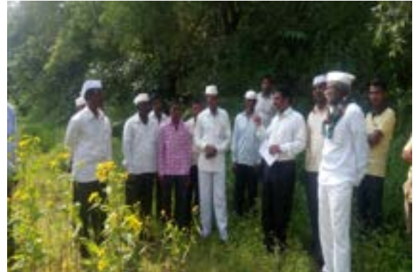
Left : Field day celebration on STCR Finger Millet at Jategaon (Bk), Traymbakeshwar Right : Exposure visit of PF at ZARC, Igatpuri