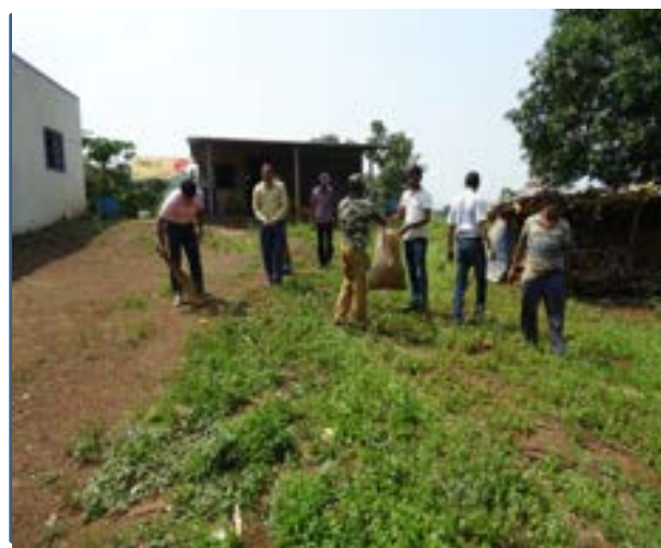
Left : Maintenance of chicks for demonstrations at KVK experimental farm