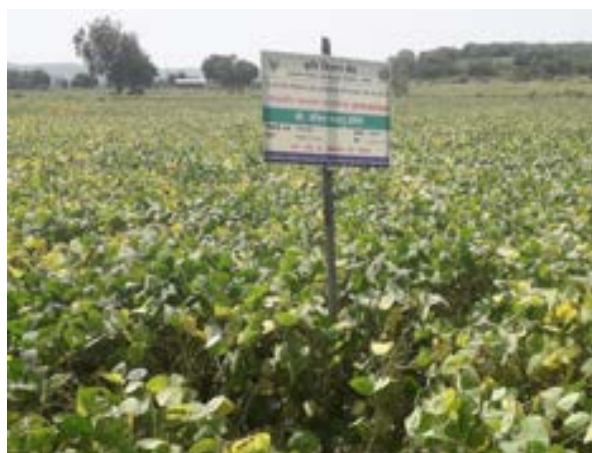
Left : Pod filling stage of Soybean demonstrated plot in village, Moh Tal. Sinnar Right : Pod development stage of Soybean demonstrated plot in village, Moh Tal. Sinnar