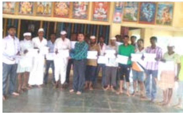
Left : Collection of soil samples at Jategaon (Bk), Traymbakeshwar Right : Soil Health Card distribution at Jategaon (Bk), Traymbakeshwar