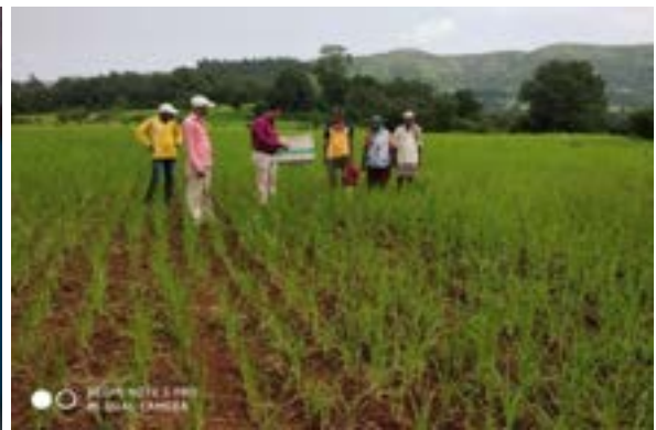
Left : STCR based fertilizer distribution at Jategaon (Bk), Traymbakeshwar Right : Monitoring STCR plot by Scientists at Jategaon (Bk), Traymbakeshwar