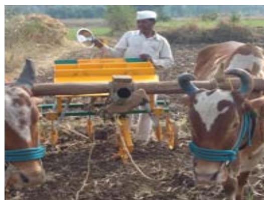
FLD on Multicrop planter for wheat & proposed for employment generation through custom hiring services for marginal & small farmers at village chirapali Tal. Trimbakeshwar