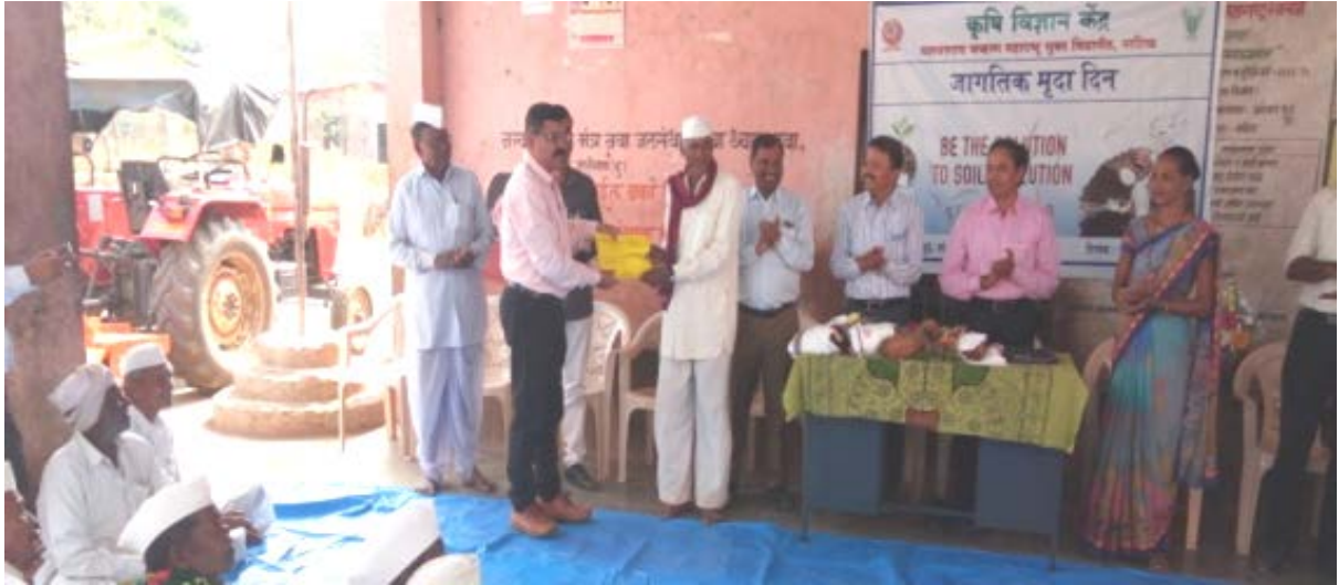
World Soil day : Soil Health Card Distribution at Jategaon (Bk), Traymbakeshwar