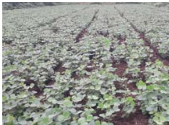
Left : Germination stage of Soybean demonstrated plot in village, Moh Tal. Sinnar Right : Branching stage of Soybean demonstrated plot in village, Moh Tal. Sinnar