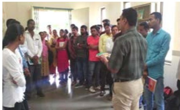
Left : Training on INM Paddy at Jategaon (Bk), Traymbakeshwar Right : Training on Soil and Water testing for Rural Youth at KVK campus