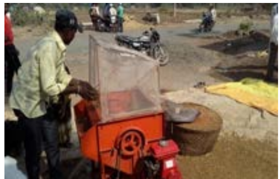
Right : Alternative use of mini thresher for finger millets in tribal area for marginal & small farmers at village chirapali Tal. Trimbakeshwar