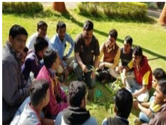
Left : Farmers Training on Opportunities in Fruit & Vegetable Processing Right :RY Training on Nursery Management Grafting Method Demonstration