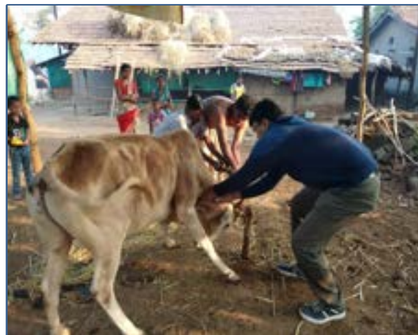
Left : Vaccination to animals for FMD disease in tribal areas