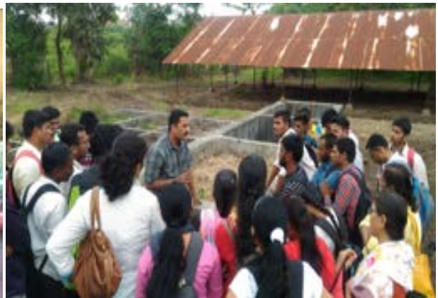
Left : Training on INM Finger Millet at Jategaon (Bk), Traymbakeshwar Right : Training on Soil and Water testing for Rural Youth at KVK campus