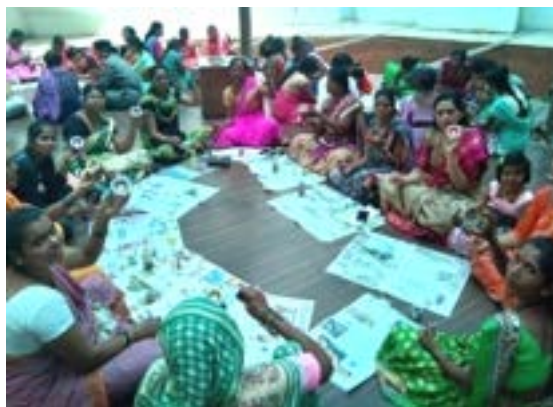
Left : Training conducted on seasonal local fruit Karoanda processing for farm women Right : Training conducted on Candle making for Self Help Group women