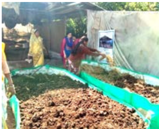
Left : Training with demonstration conducted on Mushroom cultivation for Rural Youth Right : Training conducted on Vermicompost for farm women