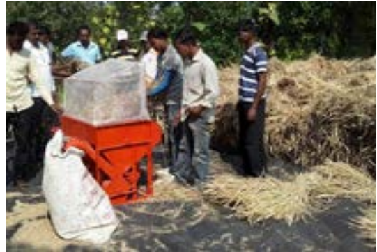
OFT on mini paddy thresher for small and marginal farmers at village chirapali Tal. Trimbakeshwar