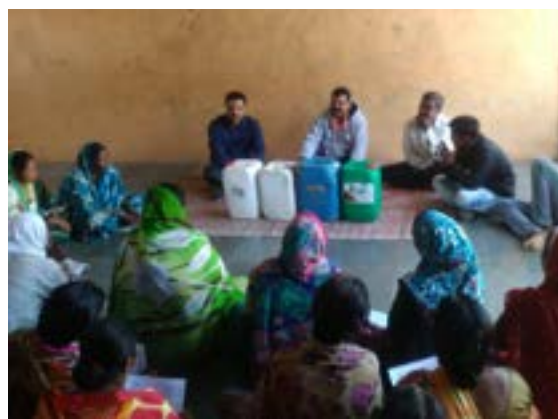
Left : Training on chickpea production technology in village, Bahadurwadi Tal. Chandwad Right : Metarhizium anisopliae & Trichoderma for IPM in village Bahadurwadi Tal. Chandwad