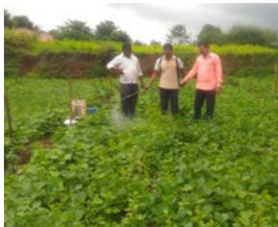
Left : Soil health card under CFLD in village, Moh Tal. Sinnar Right : Guiding about herbicide application for CFLD soybean plot in village, Moh Tal. Sinnar