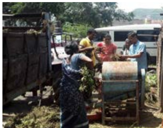
Left : Demonstration Custom hiring services Farmers club member vertical conveyor reaper in the cluster villages, Chirapailli Tal trimbakeshwar Right: Demonstration of groundnut stripper and community use for marginal & small farmers at village jategaon, Tal. Trimbakeshwar