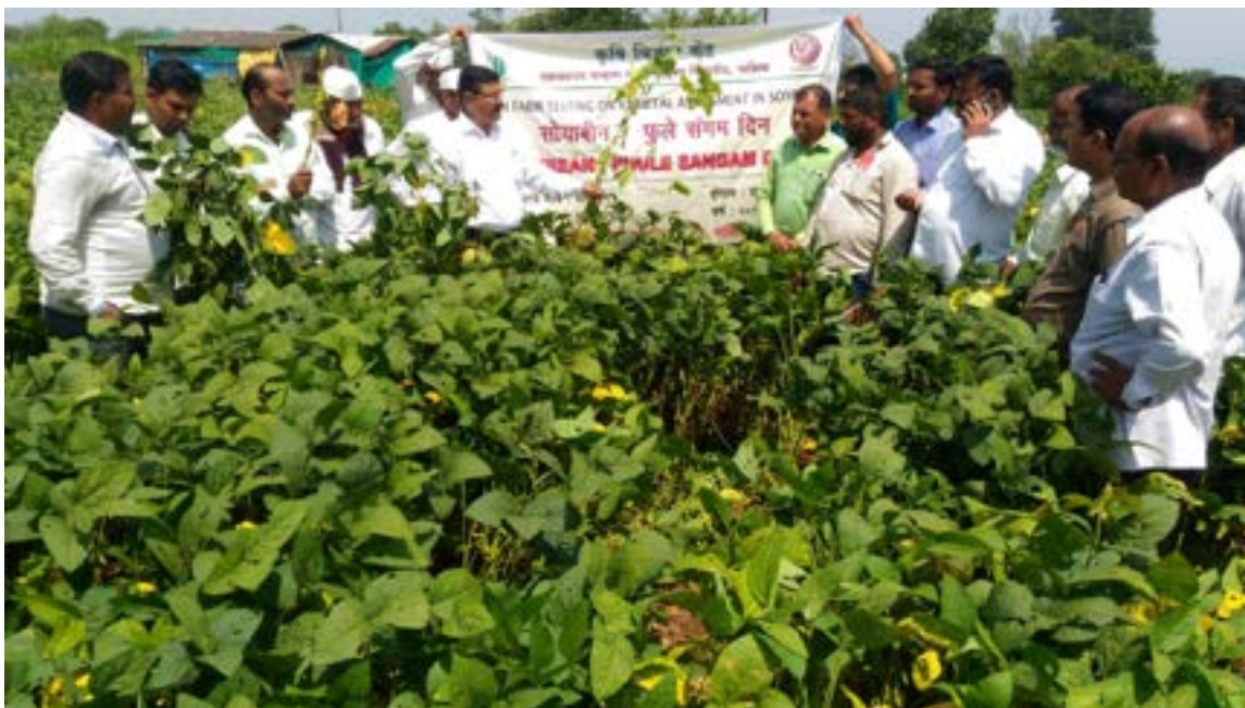
Celebration of field day on Soybean OFT variety Phule Sangam at Moh, Tal. Sinnar