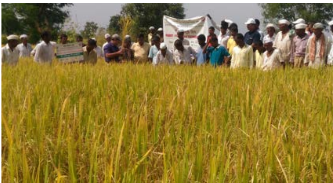
Field day celebration on Paddy FFT at Jategaon, Tal. Trambakeswar