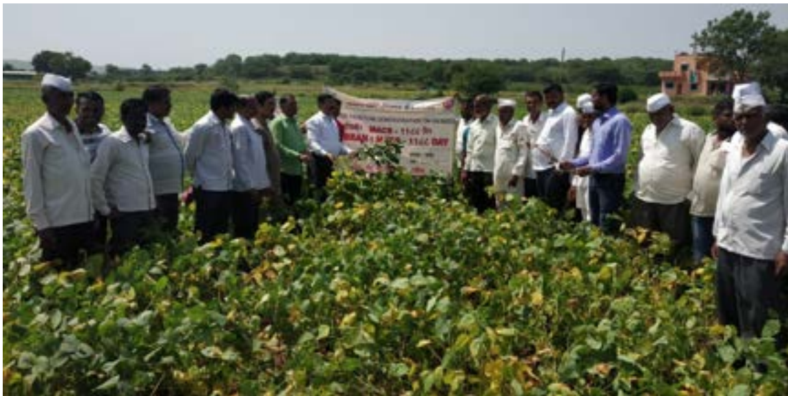
Celebration of field day of Soybean MACS-1188 varietal CFLD in village, Moh Tal. Sinnar