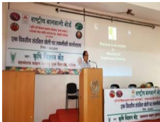
Left :Tribal farmers Training on increasing Productivity Right :Workshop on Protected cultivation of Horticultural Crops