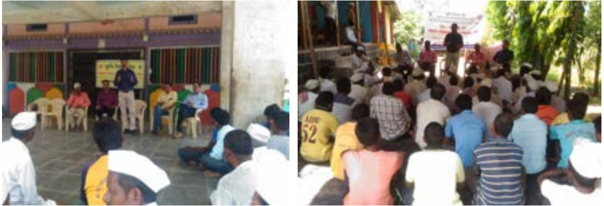
Left : Group discussion and selection of participants for demo of FFT paddy at Jategaon Right : Training on four fold technology of paddy at Jategaon, Tal. Trymbakeshwar