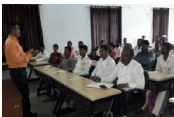
Left : On campus Training of Soybean Production Technology conducted for soya growers Right : Training of Soybean Production Technology for Extension functionaries at RAMETI