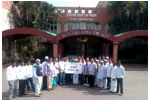
Left : Field day celebration on STCR Onion at Jategaon (Bk), Traymbakeshwar Right : Exposure visit of PF at CRS, Onion, Rajgurunagar, Pune