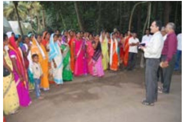
Left : Training on Dry land Fruit Plantation Under TSP to tribal Farmers of Surgana Right :Tribal women farmers Visit to KVK Farm