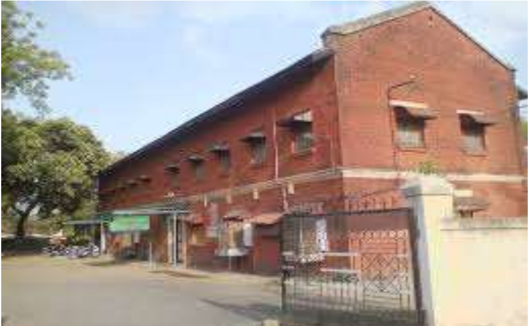
REGIONAL CENTRE, NAGPUR BUILDING & PREMISES