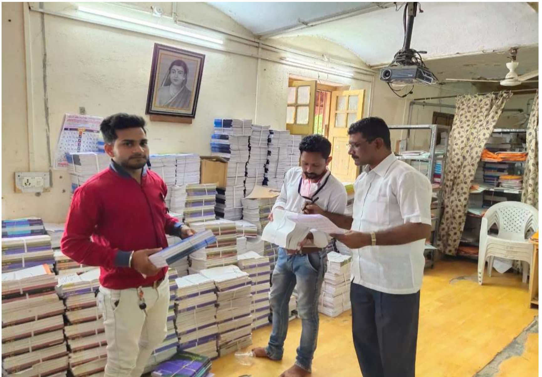
BOOK DISPATCH STORE