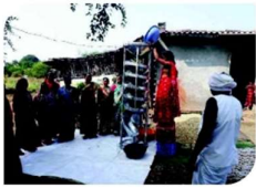
Soybean cleaning through community use of spiral separator