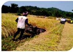
Paddy Vertical Conveyour Reper