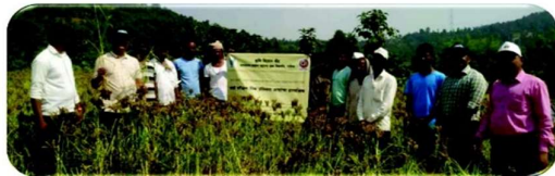
STCR Finger millet