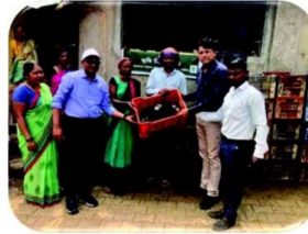
Backyard Poultry: Black Australorp