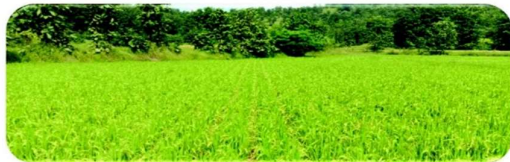
Four Fold Paddy