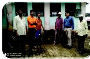
Goat Farming: Osmanabadi Breed