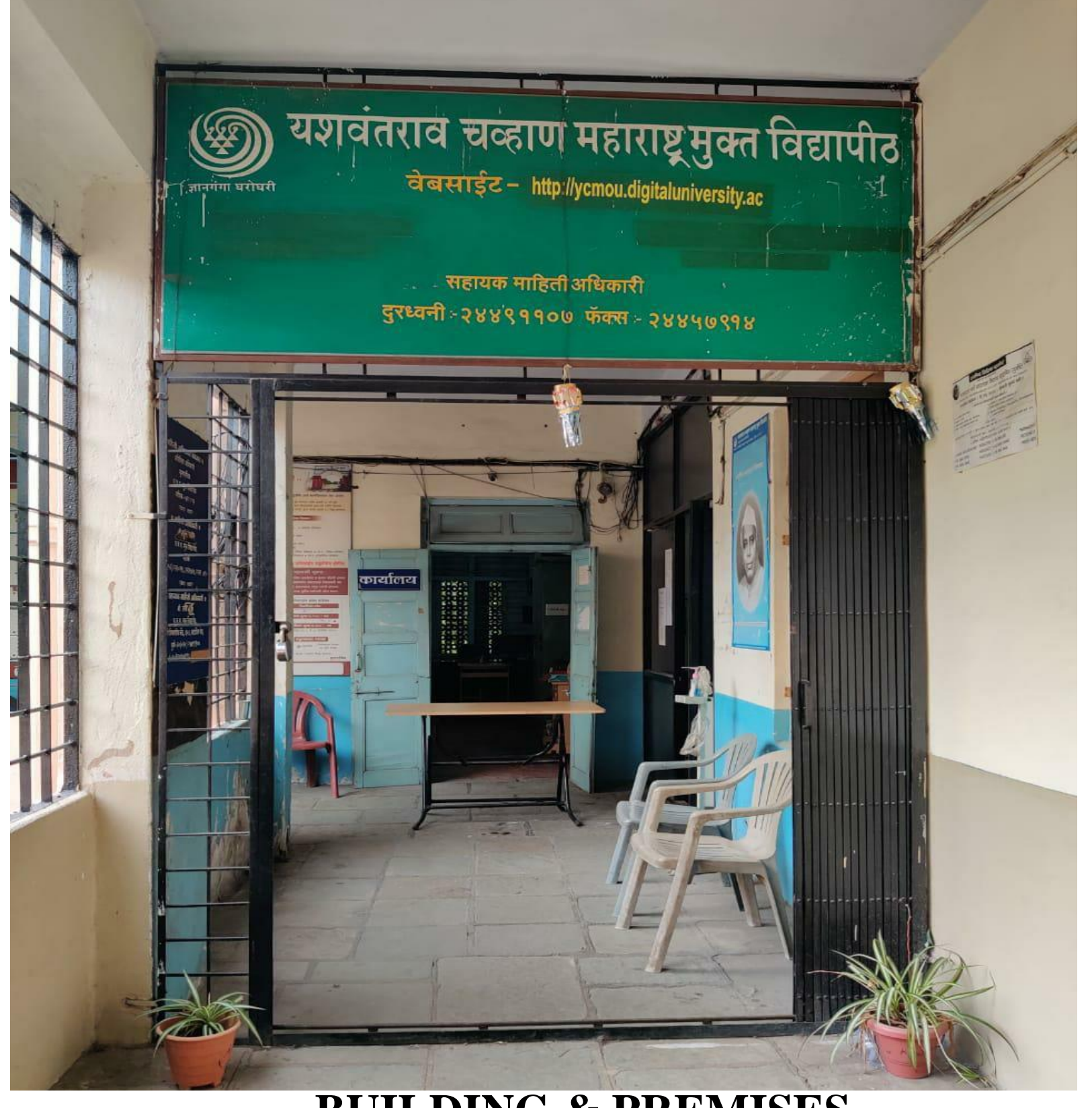
BUILDING & PREMISES