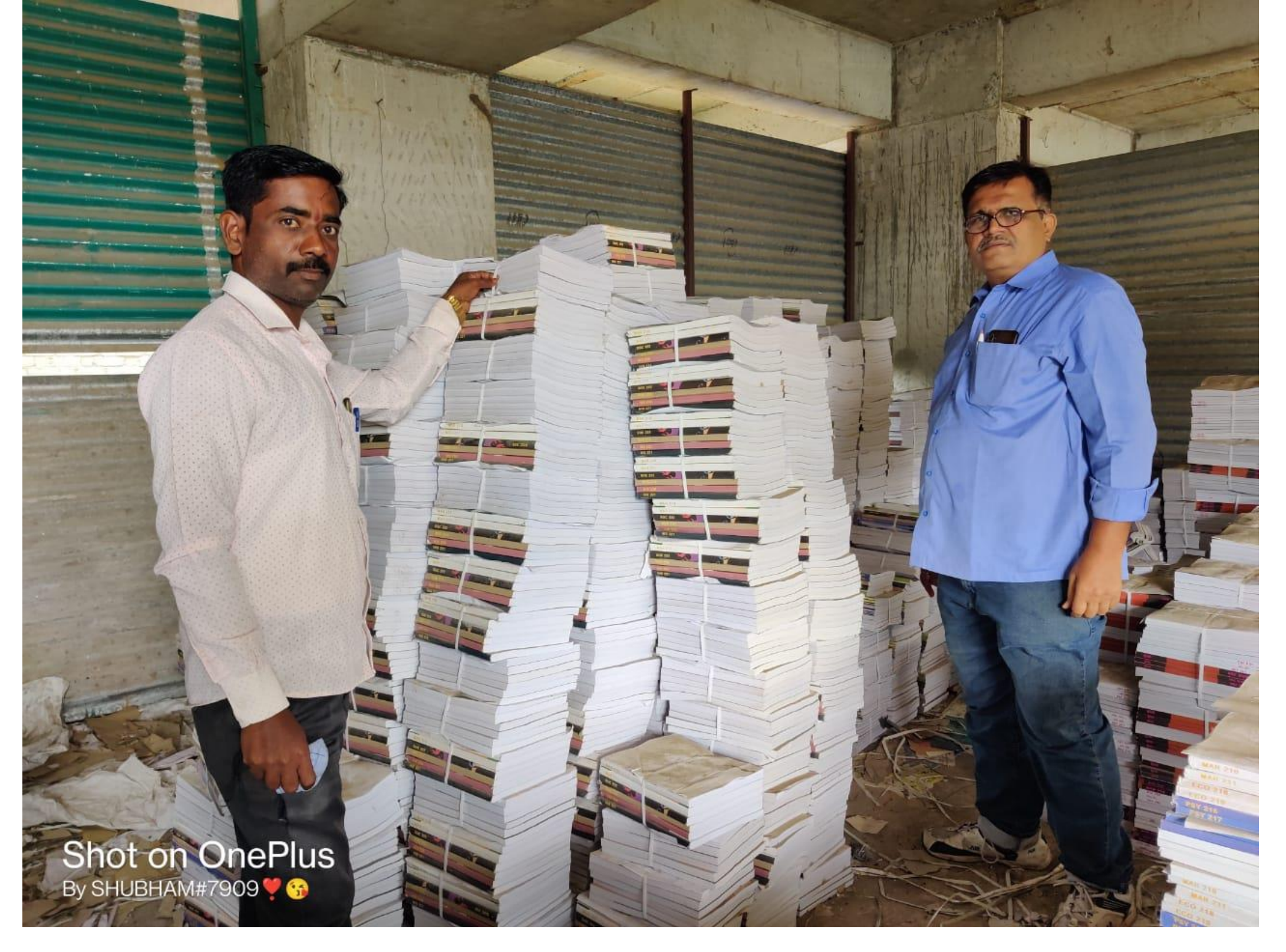
BOOK DISPATCH STORE